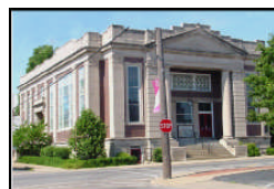
United Methodist Church Home of the Rotary Club of Marion for over 83 years