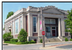
United Methodist Church Home of the Rotary Club of Marion for over 83 years